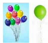
duō / shǎo 多/少